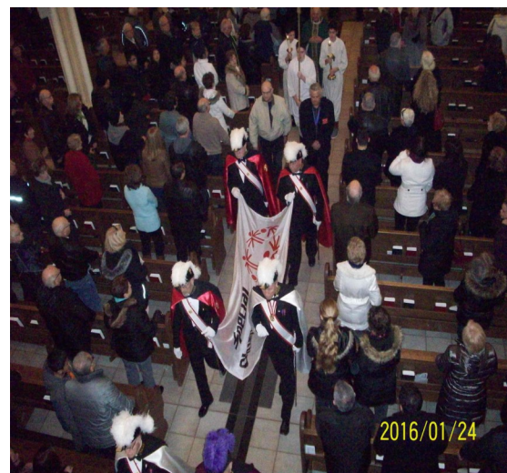
Special Olympics Flag leaves the noon mass on Jan. 24th, 2016